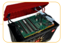
Screw Opening •