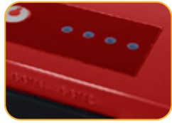
• 4 Power Indicator