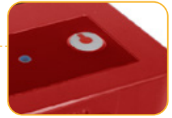
Reset Button •