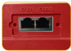
• Terminal Communication Interface